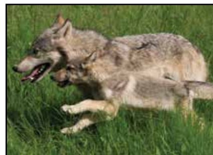
9 Months to 2 Years